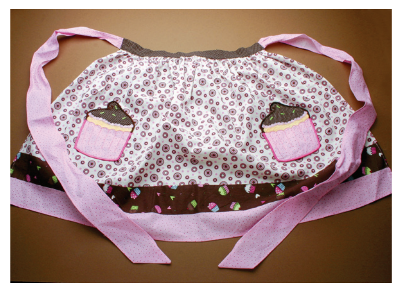
Adult apron with design FD0413 used for pockets

Simplicity is a registered trademark of Simplicity Pattern Co. Inc.