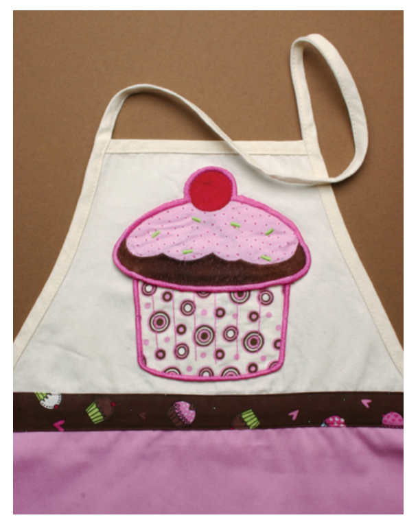
Child's apron with separate cupcake pieces. FD0414 top and FD0415 bottom.