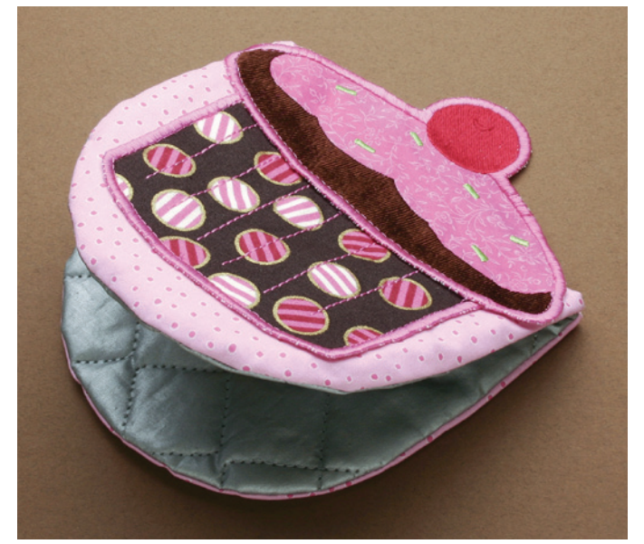
Cupcake Potholder uses separate cupcake pieces. FD0414 top and FD0415 bottom.

Simplicity is a registered trademark of Simplicity Pattern Co. Inc.