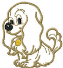
PUPPY* File: QCH6257 2.39"W X 2.67"H ST: 2,158 Colors: 3 1. Med. Gold 2. Black 3. Brown3