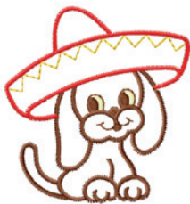
PUPPY* File: QCH6253 3.40"W X 3.61"H ST: 2,505 Colors: 4 1. Lt. Lt. Yellow2 2. Dk. Brown 3. Med. Gold 4. Red