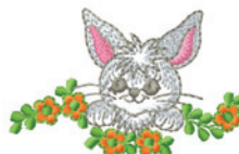
RABBIT* File: QCH6259 3.05"W X 1.93"H ST: 3,544 Colors: 5 1. Orange2 2. Dk. Dk. Lime 3. Gray 4. Med. Pink 5. Dk. Dk. Gray