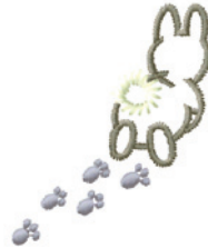
BUNNY* File: QCH6244 2.11"W X 2.58"H ST: 1,172 Colors: 3 1. Lt. Charcoal 2. Med. Umber 3. Lt. Lt. Yellow