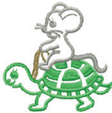
TURTLE & MOUSE* File: QCH6242 2.67"W X 2.66"H ST: 3,132 Colors: 3 1. Brown3 2. Green 3. Dk. Gray