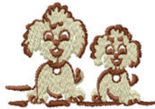
PUPPIES* File: QCH6249 2.38"W X 1.65"H ST: 3,453 Colors: 2 1. Tan 2. Dk. Brown