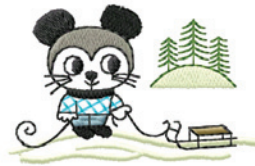
MOUSE* File: QCH6255 3.54"W X 2.16"H ST: 3,425 Colors: 7 1. Turquoise2 2. Brown3 3. Lt. Lt. Yellow 4. Blue Gray2 5. Dk. Dk. Gray 6. Dk. Green 7. Black