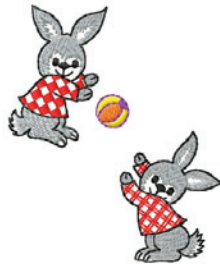
BUNNIES* File: QCH6254 3.17"W X 3.80"H ST: 3,420 Colors: 6 1. Med. Gray 2. Red 3. Black 4. Dk. Yellow 5. Orange2 6. Dk. Lavender