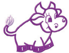
COW* File: QCH6247 3.24"W X 2.59"H ST: 3,150 Colors: 2 1. Lt. Purple 2. Dk. Dk. Purple