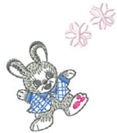
BUNNY* File: QCH6256 2.59"W X 3.04"H ST: 1,941 Colors: 5 1. Lt. Lt. Pink 2. Dk. Gray 3. Dk. Pink 4. Med. Blue 5. Dk. Dk. Charcoal