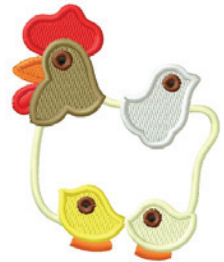
CHICKENS* File: QCH6251 2.71"W X 3.36"H ST: 6,902 Colors: 8 1. Orange2 2. Red 3. Lt. Lt. Yellow2 4. Black 5. Lt. Gray 6. Brown3 7. Med. Yellow3 8. Dk. Brown