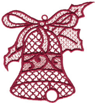
BELL* File: XM1343 (09) 3.42"W X 3.75"H ST: 12,083 Colors: 1 1. Dk. Red