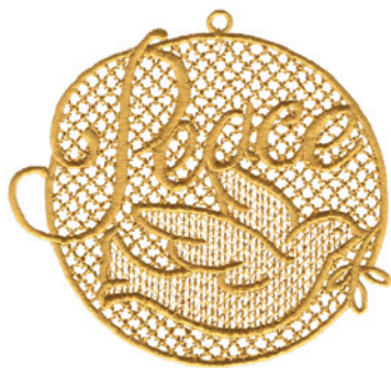
PEACE* File: XM1359 (09) 4.78"W X 4.50"H ST: 20,617 Colors: 1 1. Med. Gold