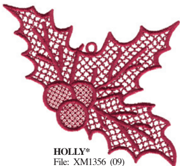
HOLLY* File: XM1356 (09) 5.27"W X 4.50"H ST: 17,327 Colors: 1 1. Dk. Red