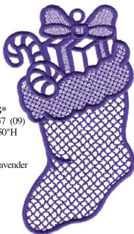
STOCKING* File: XM1357 (09) 3.85"W X 6.50"H ST: 16,794 Colors: 1 1. Dk. Dk. Lavender