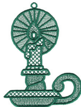
CANDLE* File: XM1362 (09) 4.50"W X 6.04"H ST: 18,880 Colors: 1 1. Med. Green

* SOME WHITE AREAS IN DESIGN ARE NEGATIVE