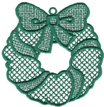
WREATH* File: XM1353 (09) 4.50"W X 4.65"H ST: 20,374 Colors: 1 1. Med. Green