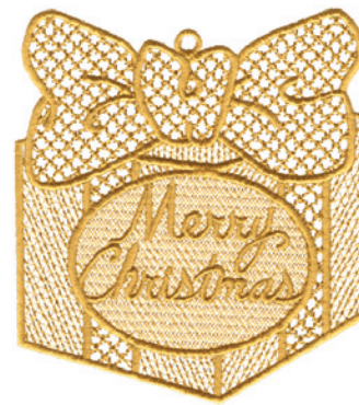
MERRY CHRISTMAS* File: XM1355 (09) 4.50"W X 5.08"H ST: 23,912 Colors: 1 1. Med. Gold