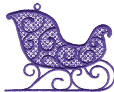
SLEIGH* File: XM1348 (09) 3.89"W X 3.10"H ST: 10,451 Colors: 1 1. Dk. Dk. Lavender