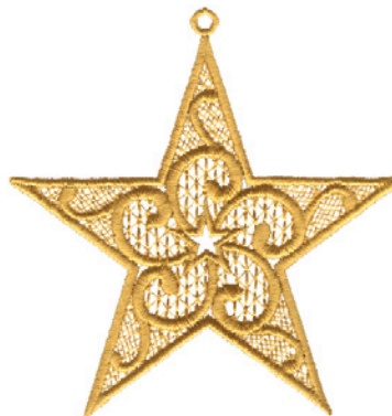
STAR* File: XM1351 (09) 3.30"W X 3.47"H ST: 6,659 Colors: 1 1. Med. Gold