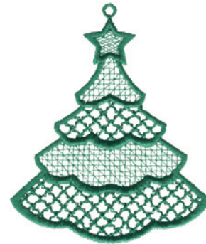
CHRISTMAS TREE* File: XM1345 (09) 3.24"W X 3.90"H ST: 6,420 Colors: 1 1. Med. Green