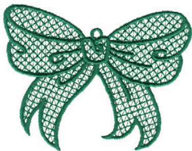
BOW* File: XM1349 (09) 3.89"W X 3.08"H ST: 9,984 Colors: 1 1. Med. Green