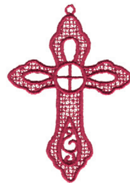
CROSS* File: XM1352 (09) 2.71"W X 3.91"H ST: 7,167 Colors: 1 1. Dk. Red

* SOME WHITE AREAS IN DESIGN ARE NEGATIVE